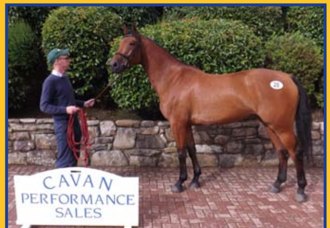
Lot 28 €15,000 Buyer - N Ireland

The Premier 3 year old sale on Wednesday 16th generated huge interest and a fantastic crowd attended. These premier 3 year olds were selected prior to the sale and indeed proved themselves in their premier spot with the fantastic prices they achieved.