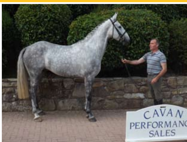
TOP LOT at Friday's Sale 5 Year Old, Grey Gelding Lot 231A €6,650 Buyer UK