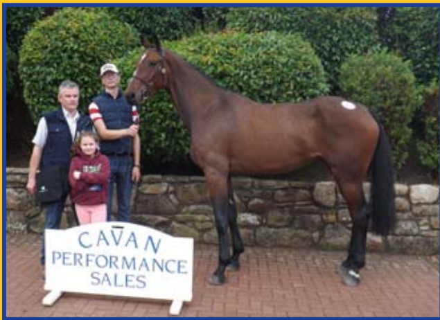
Lot 20 €20,000 Buyer - Slovenia