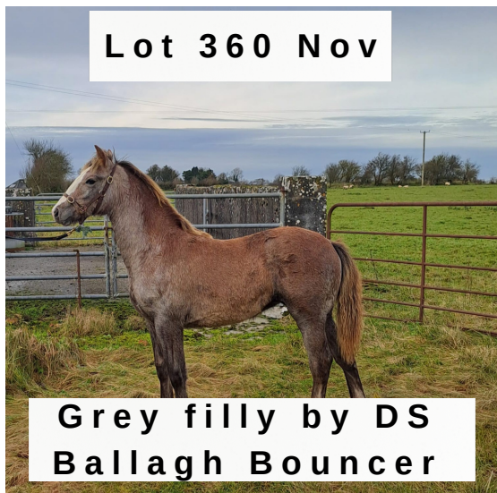
Grey filly by DS Ballagh Bouncer

The National Registered Irish Draught sales took their usual slots in early October and the end of November. There was quite a resurgence in demand evident at these sales and which saw some fantastic prices being achieved;