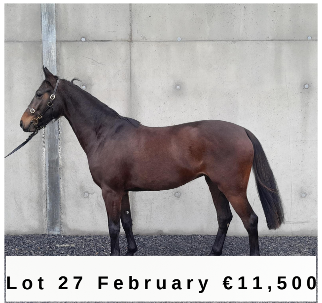
Lot 27 February €11,500