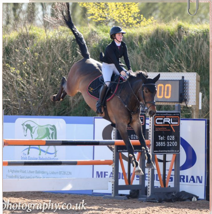
Lot 69 March €14,000