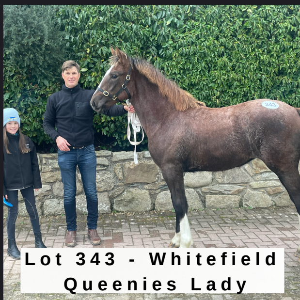
Lot 343 - Whitefield Queenies Lady