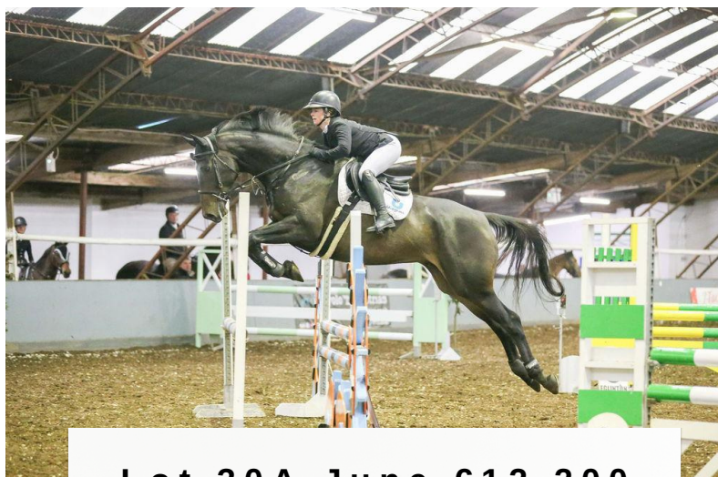
Lot 30A June €12,200