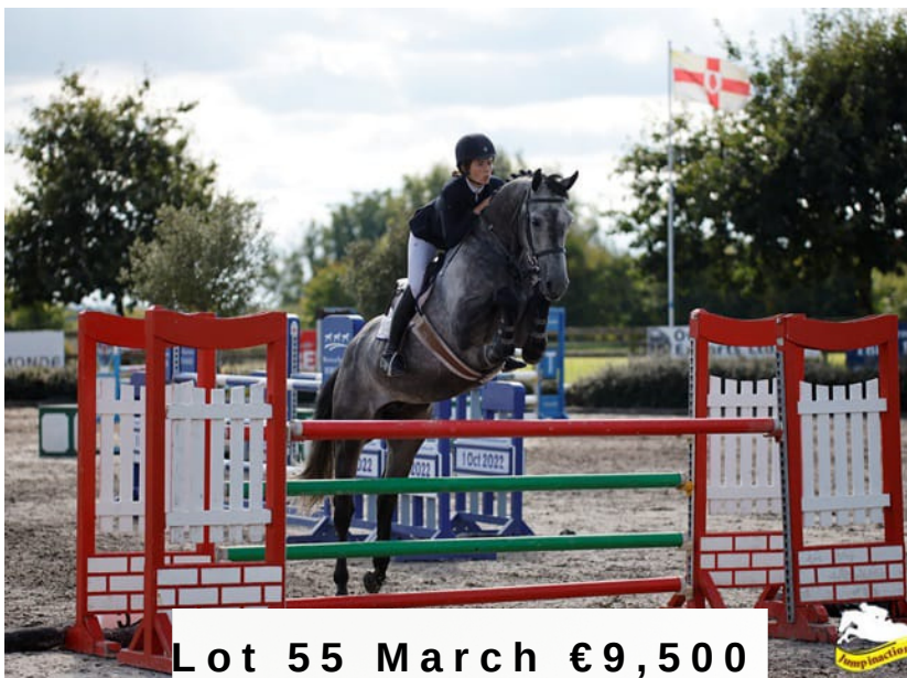
Lot 55 March €9,500