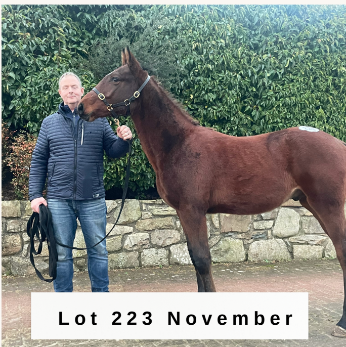
Lot 223 November