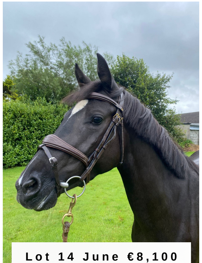
Lot 14 June €8,100