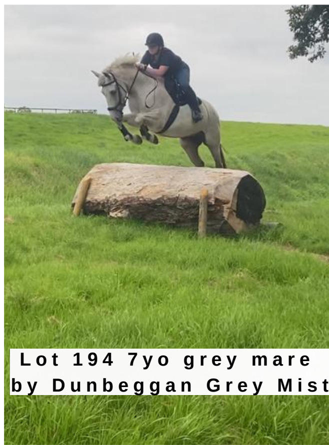
Lot 194 7yo grey mare by Dunbeggan Grey Mist