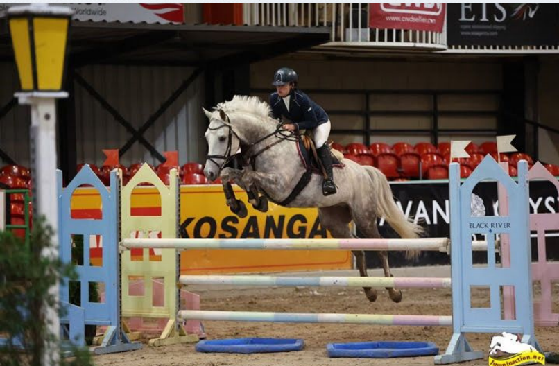
Lot 115 August €12,000

2023 was unquestionably a very positive year in all areas of Sales including clearance, averages, Lots Sold and turnover.