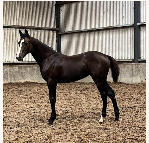
Lot 78 September

The Young Stock Sport Horse Sales in September which included a Premier Foal Selection and the November Sale which included the Winter Foal Selection both saw price, average and clearance holding steady. The dedication and hard work that Breeders apply has been definitely on show. Much thought and study is put into Foals being produced now with pedigree research of the dam-line reading like a who's who in the heights of the sport horse industry! There is definitely scope for the canny buyer out there to take a chance and produce along a Star of The Future at these sales