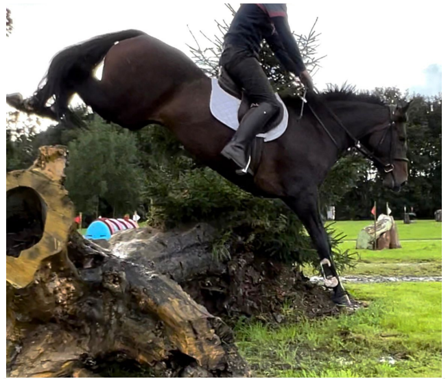
Lot 44 October €6,200

Cavan always attracted overseas buyers to the ringside and with the convenience of the Online Auction system even more countries are finding their horse or pony through Cavan including; Finland, Norway, Sweden, Switzerland, Denmark, Germany, Belgium, Poland, USA, Spain as well as the UK.