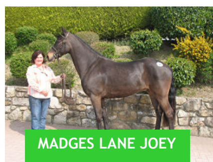
MADGES LANE JOEY