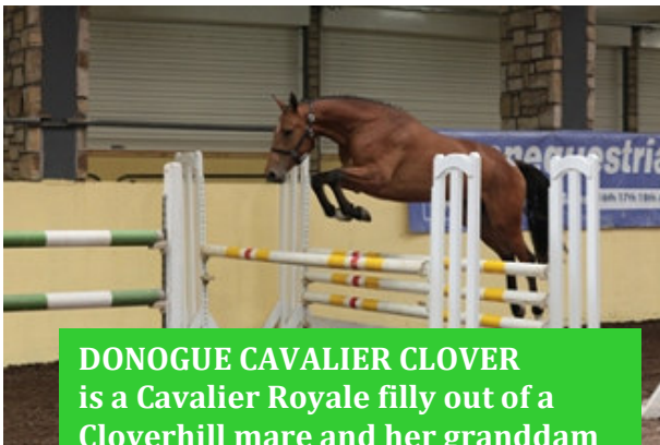
DONOGUE CAVALIER CLOVER is a Cavalier Royale filly out of a Cloverhill mare and her granddam was a half sister to Danoli.

Three year olds led the way in the higher price bracket with a 3 year old Luidam gelding out of a Lux Z mare topping the October International Performance Sale and the Premier 3 Year old Sale in August saw a 3 year old Shannondale Sarco gelding out of a Cruising mare topping the sale.