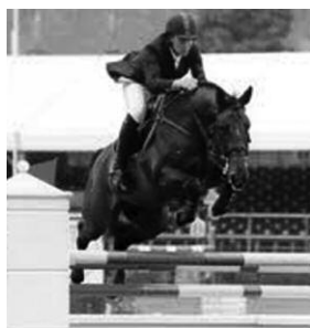
Hermes de Reve