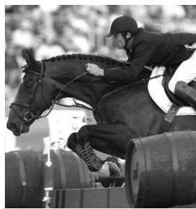
Diamant de Semilly