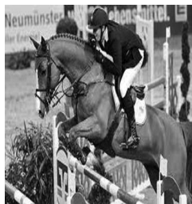
Kentucky Van't Ruytershof