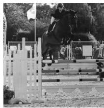
CSF Prtincess Blue