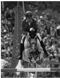
Cornado II Z