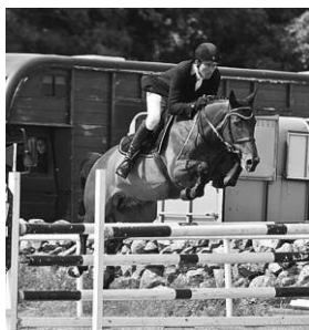
Captains Magic Touch