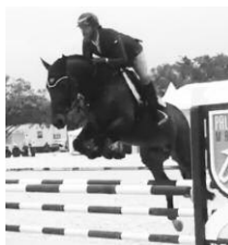
Cruisilier -Full brother Leestone Key to Cruising