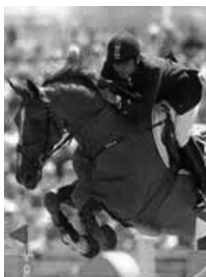
Baloubet Du Rouet