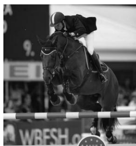
Triomphe de Muze