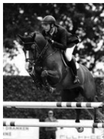
Don Diablo App. Stallion sired by Vittorio