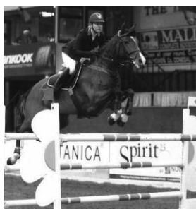
Tell it Like