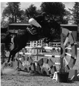
Sligo Candy Boy