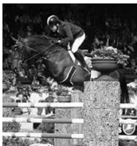
MHS Going Global