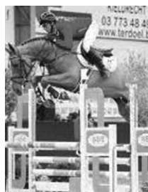
Poker de Mariposa